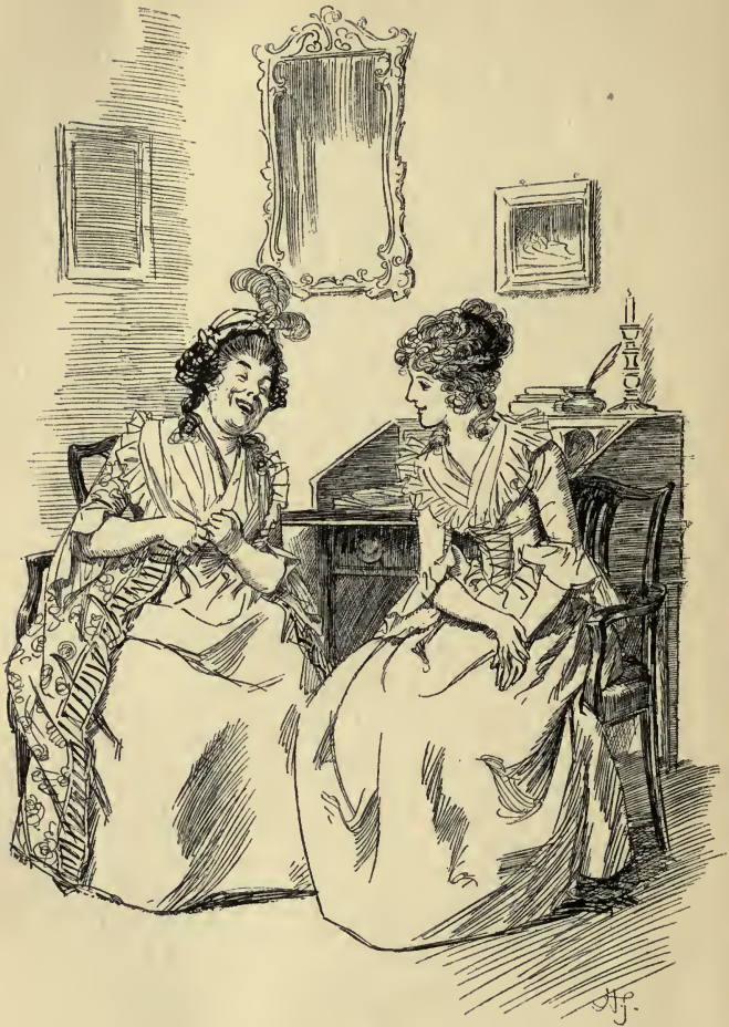
Both gained considerable amusement.